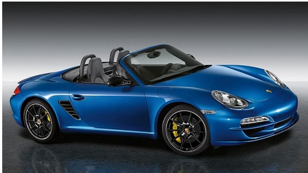
Porsche Boxster and Cayman Packages (Euro) – Click above for high-res image gallery

Our friends across the pond have four new individualization packages to choose from when they start ticking the option boxes for their new Boxster or Cayman , and while Porsche isn't offering any additional performance upgrades, the kit adds a bit more flavor to Stuttgart's entry-level convertible and coupe.